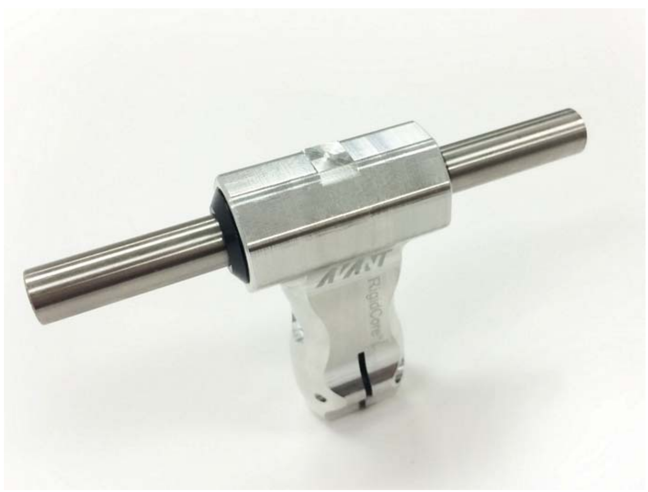
Insert the Spindle in place