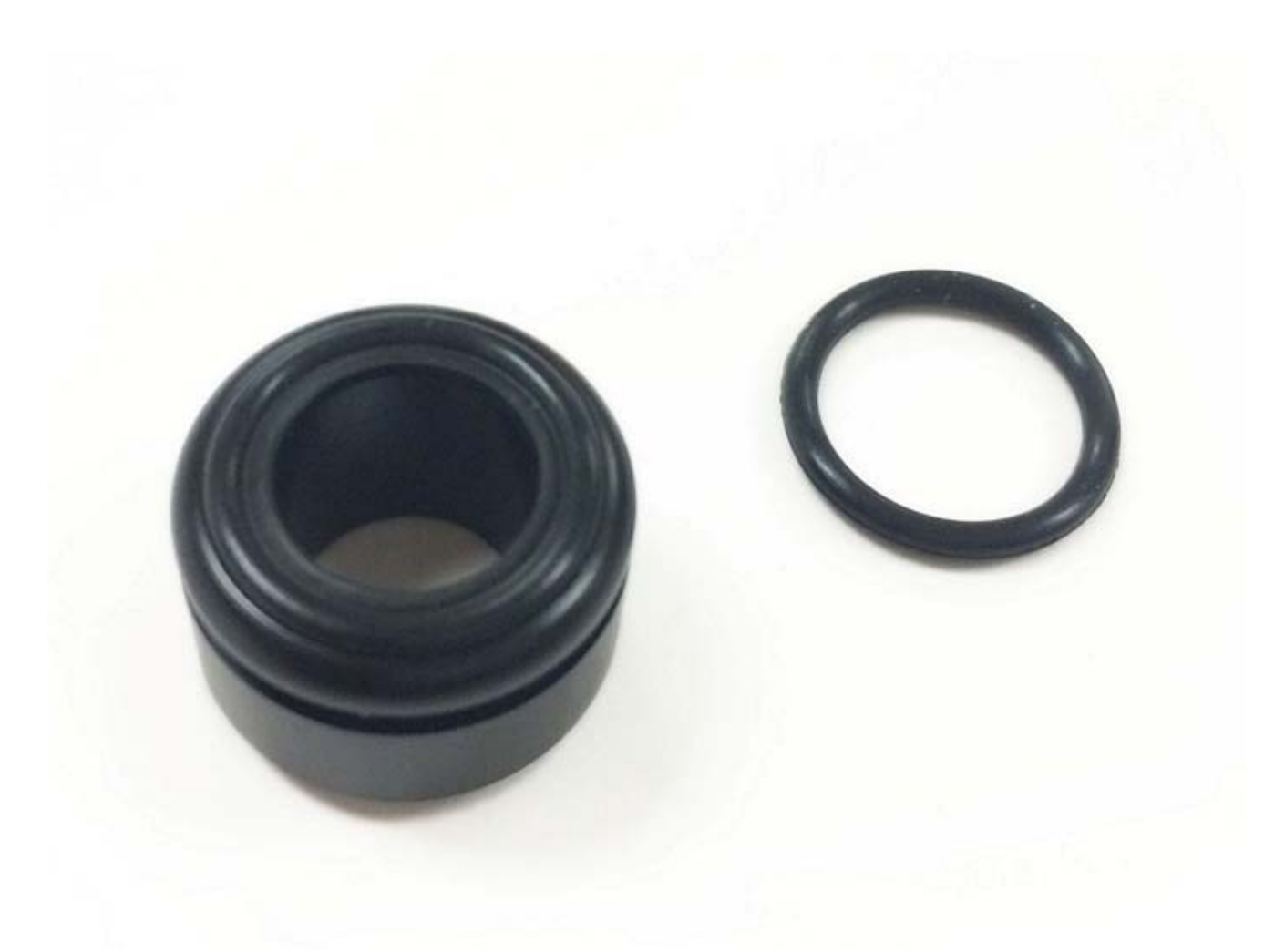
Install the inner O-Ring