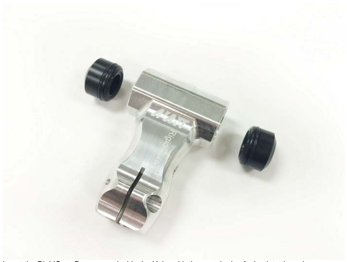
Insert the RigidCore Dampeners inside the Yoke with the round edge facing into the yoke.