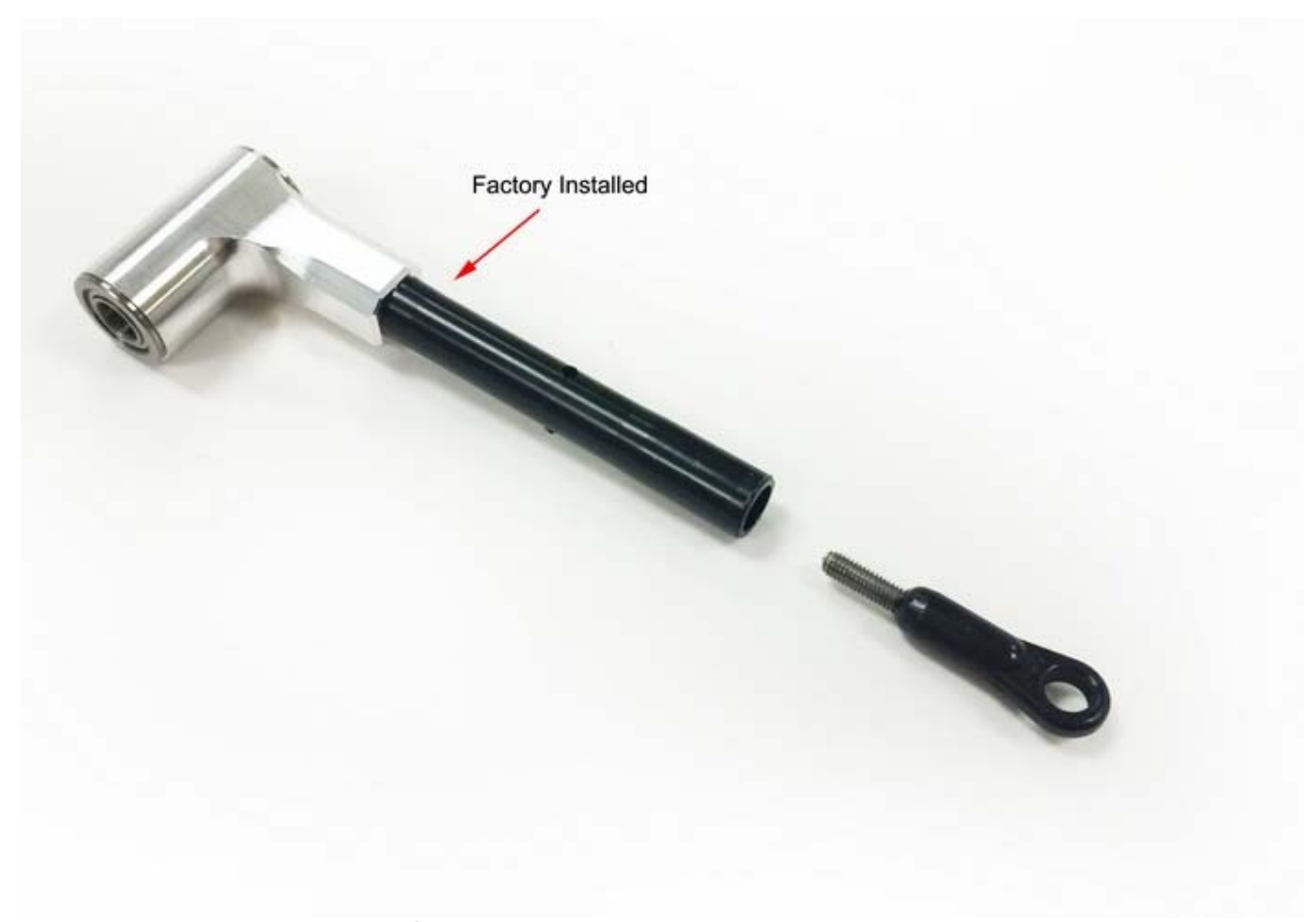
Install the Ball link into the DFC rod.