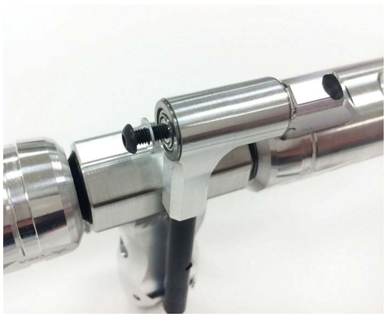
Install the M3x8 round head screw using an M3 washer.