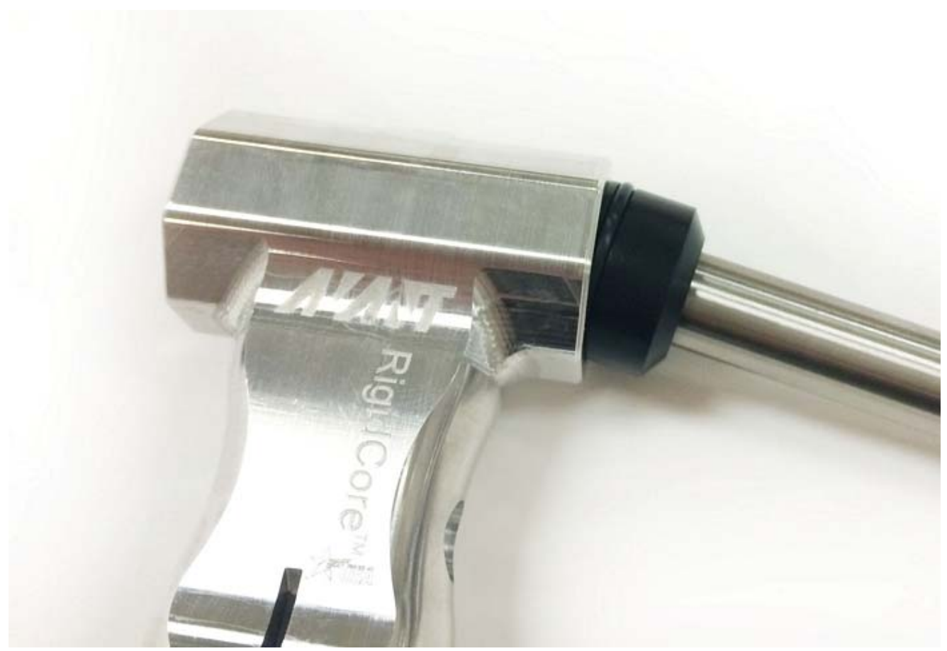
Use the spindle as a helping tool. You can use grease n this step too.