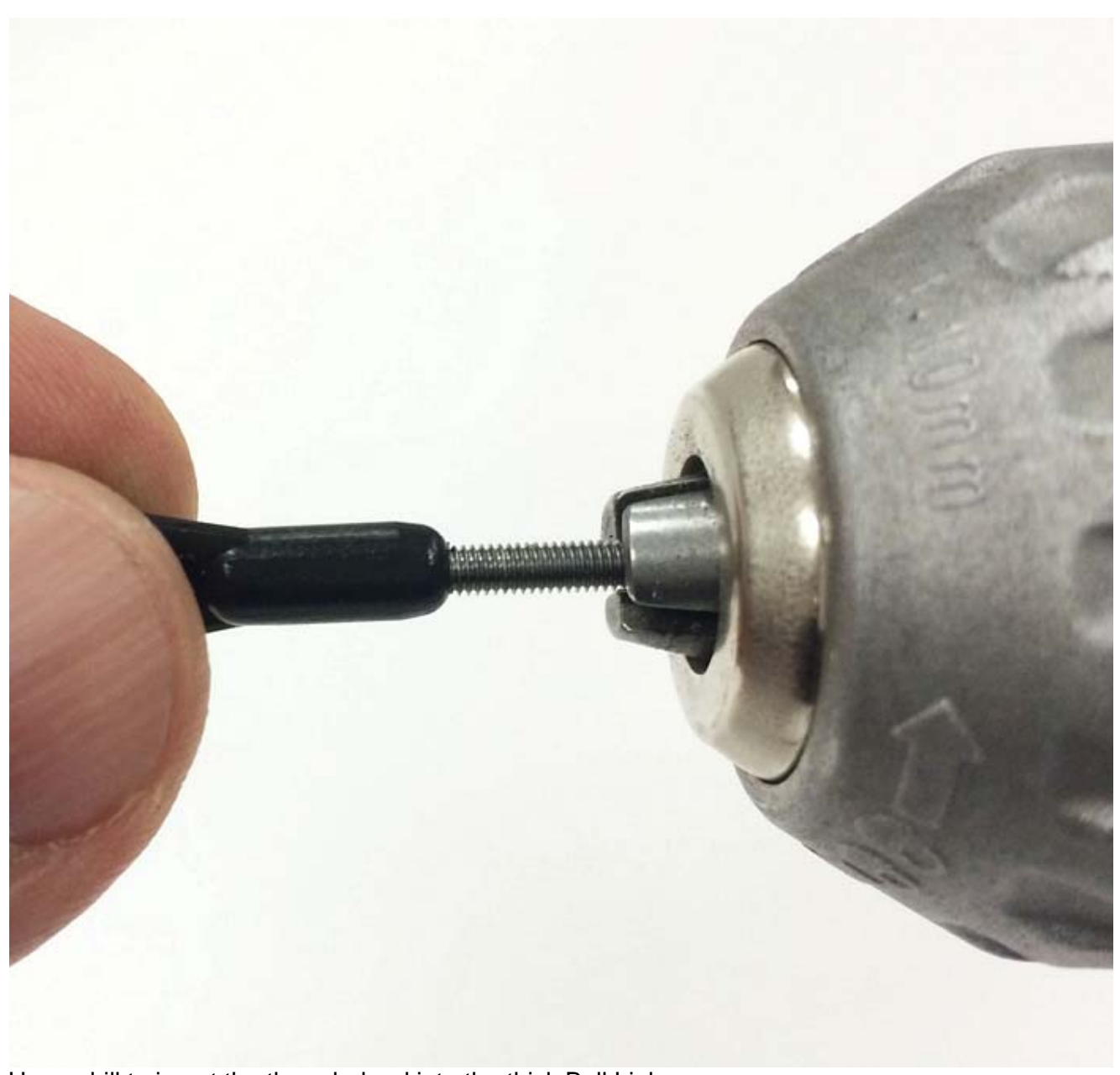
Use a drill to insert the threaded rod into the thick Ball Link