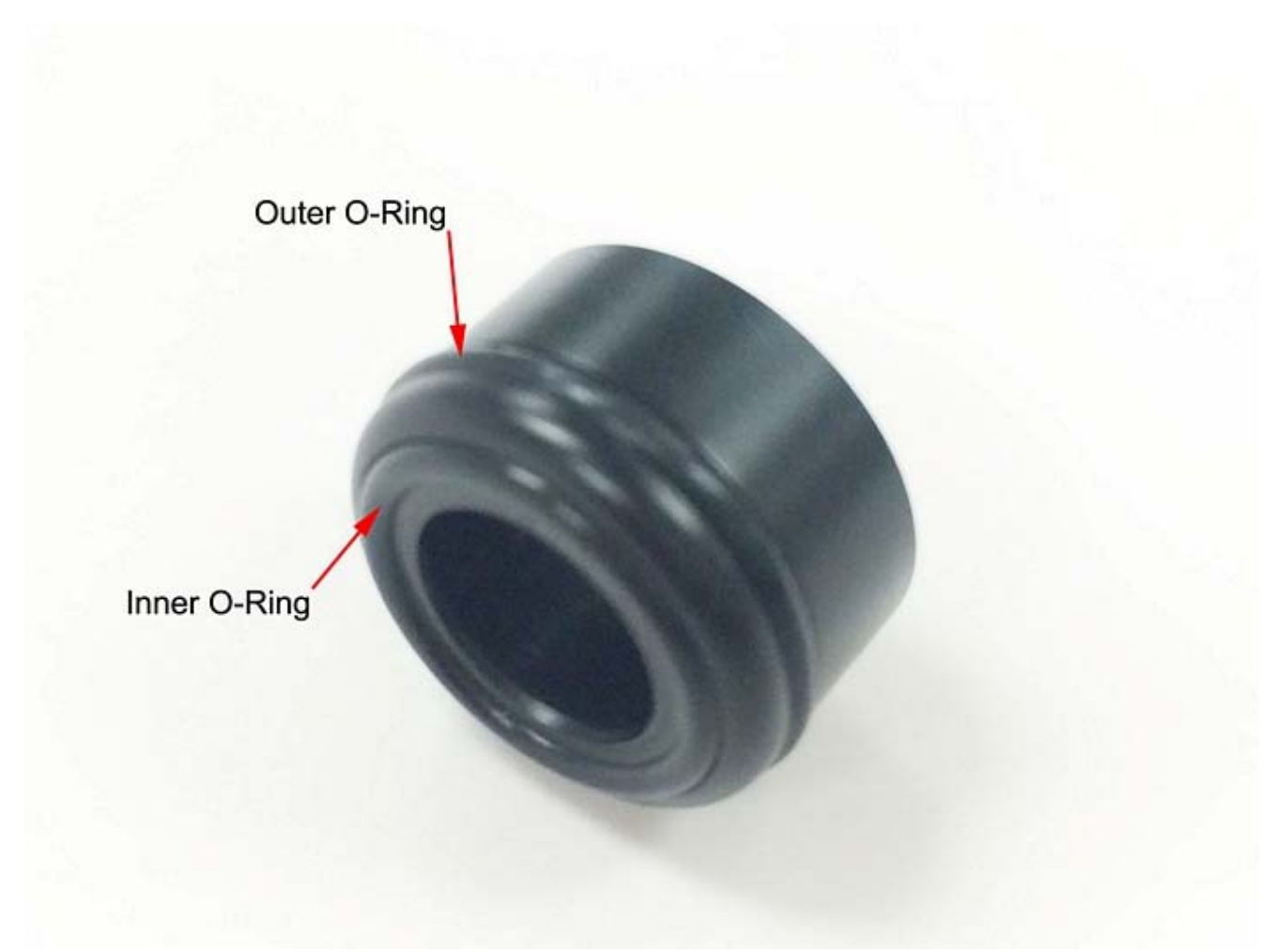
Install teh outer O-Ring