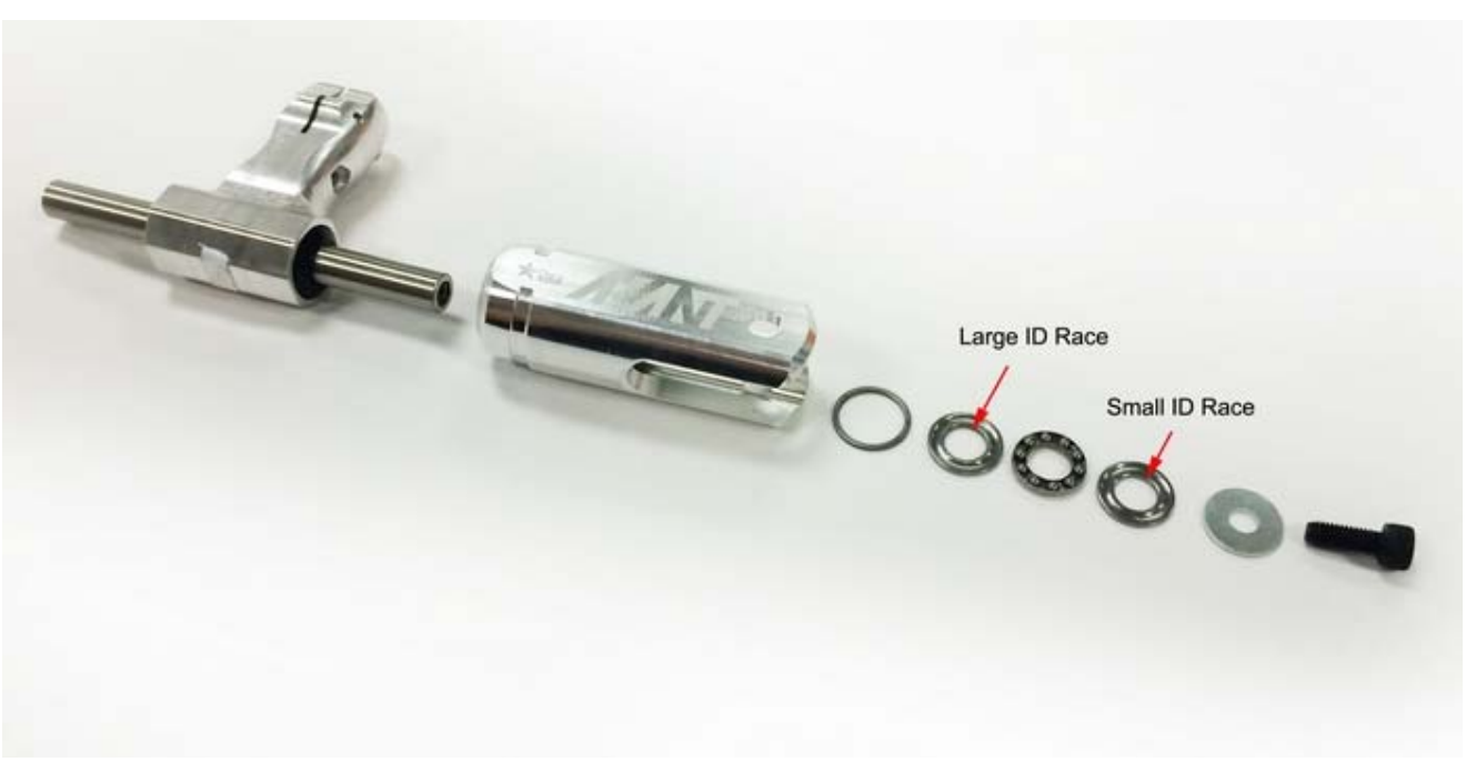
Correct way to set Thrust bearing diameters.