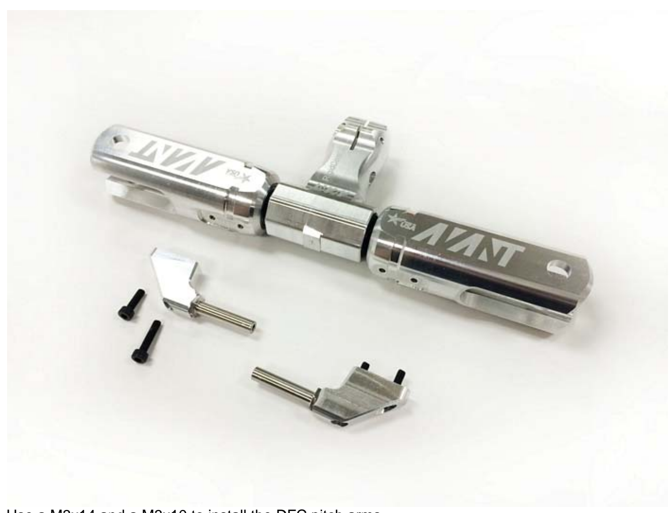
Use a M3x14 and a M3x10 to install the DFC pitch arms.