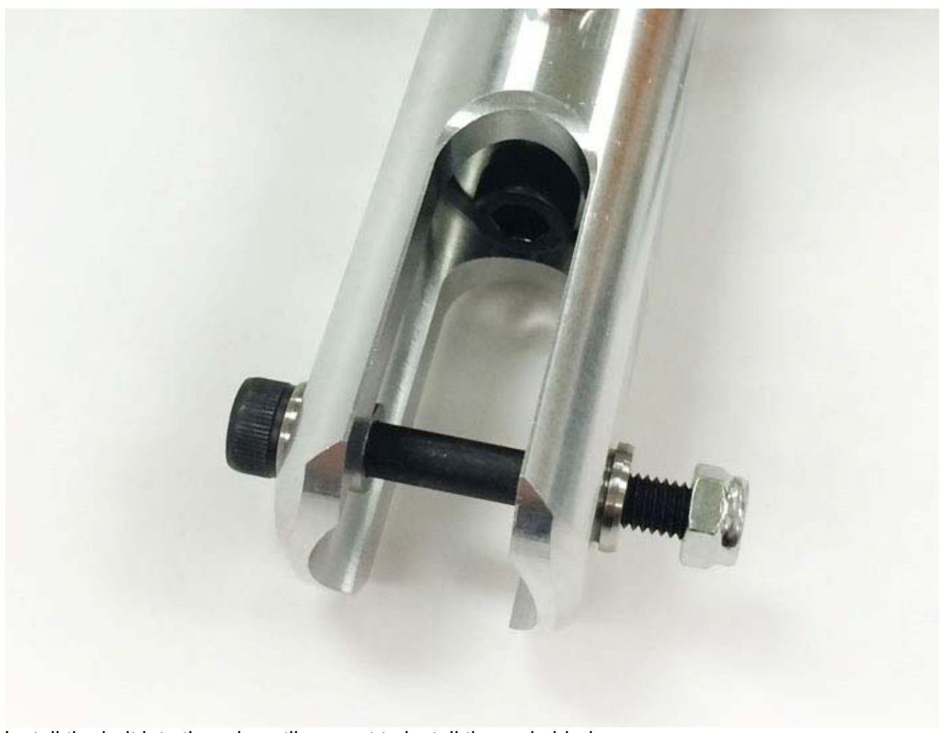
Install the bolt into the grip until you get to install the main blades.