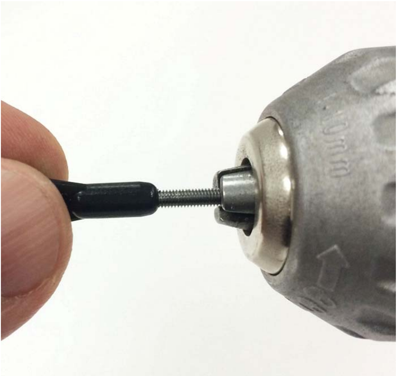
Use a drill to insert the threaded rod into the thick Ball Link