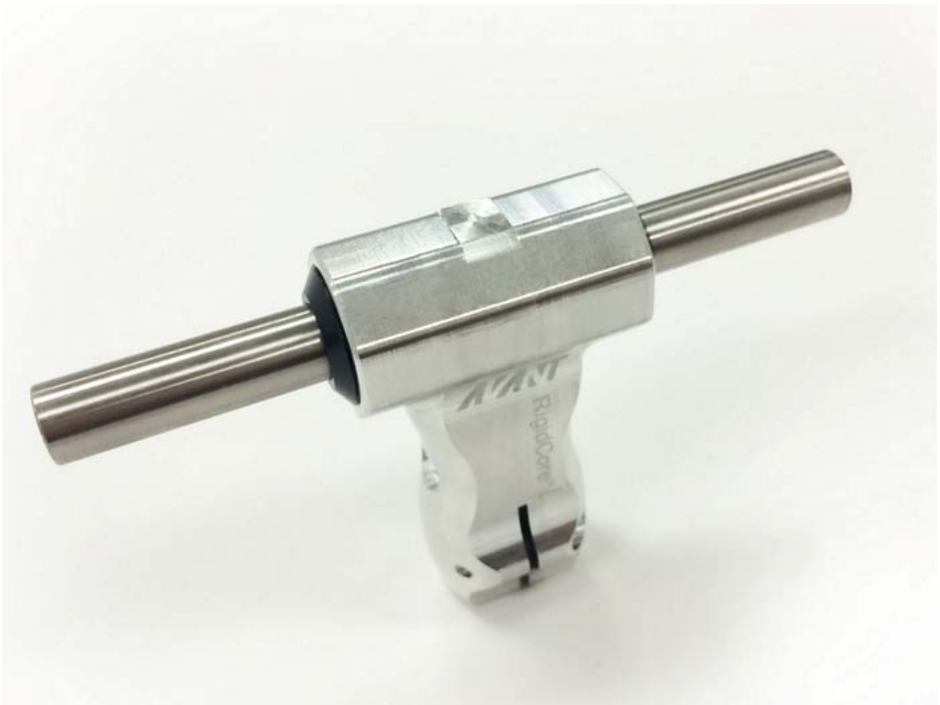
Insert the Spindle in place