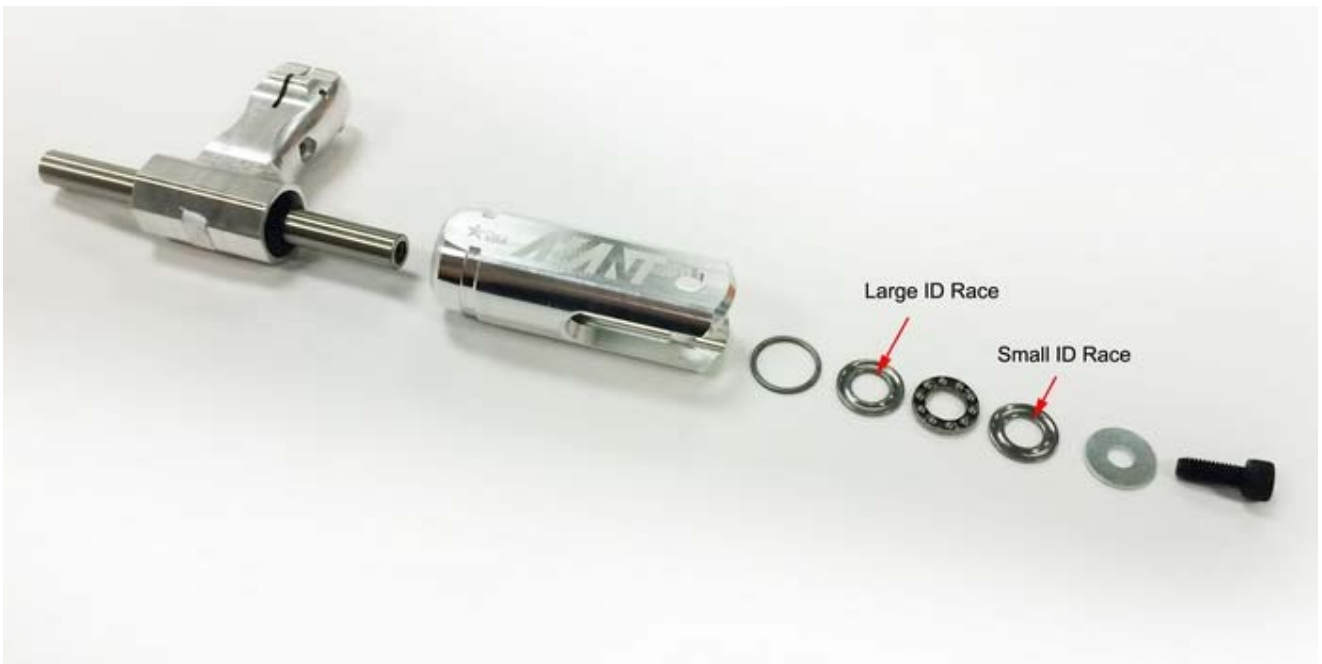
Correct way to set Thrust bearing diameters.